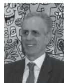
James Rizzi | Pop-Art artist New York

„I have a great respect for the achievement of the young scientists. By way of Systems Biology they take the research in the cellular and genetic domain into a new dimension.“